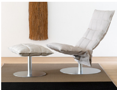
NARROW k CHAIR AND OTTOMAN

To accompany the k Chair and swivel k Chair, designed by Harri Koskinen , Woodnotes is introducing the k-Ottoman. The design of the ottoman resembles the swivel k Chair; it consists of a base plate and cushion upholstered with the Sand upholstery fabric, available in 9 colours. The k Ottoman turns the swivel k Chair into a comfortable lounge chair but it can also be used independently.